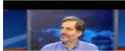
Bacterial Hydrogen Fuel Cells