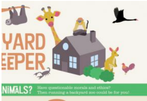
The Absurdity of Exotic Pet Laws