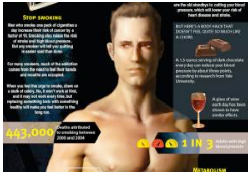
Body Hacks For A Longer Life!