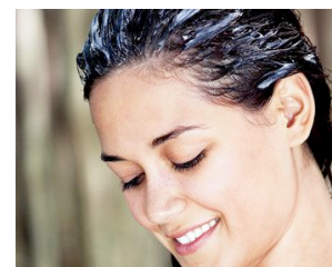
17 tips for healthy hair and skin