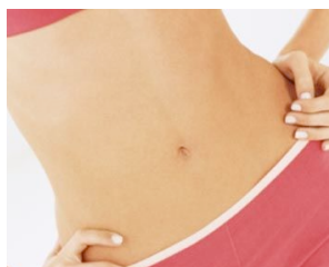
Flat stomach food guide