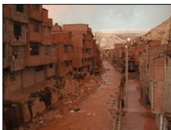
The river Mantaro which flows through La Oroya is badly polluted.

"We asked for 100% of the shares of the company as a guarantee to be sure that they are going to finish the investment for the environment."