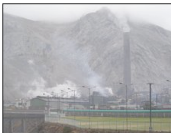
The smelter in La Oroya is one of the 10 most polluted places on earth.

But in the town of La Oroya, some 3,700 metres above the sea, a multi-metal smelter spews out thick fumes that irritate the throat and eyes.