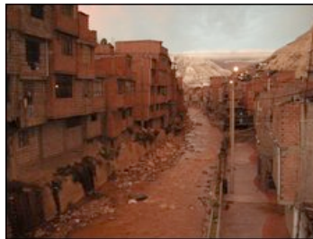
The river Mantaro which flows through La Oroya is badly polluted.

"We asked for 100% of the shares of the company as a guarantee to be sure that they are going to finish the investment for the environment."