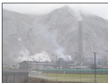
The smelter in La Oroya is one of the 10 most polluted places on earth.