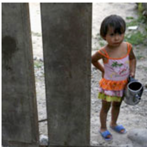
In Pictures: The World's 25 Dirtiest Cities

Unless you're in the oil business, there's little reason to brave the choking pollution of Baku, Azerbaijan. Fetid water, oil ponds and life-threatening levels of air pollution emitted from drilling and shipping land the former Soviet manufacturing center at the bottom of this year's list as the world's dirtiest city.