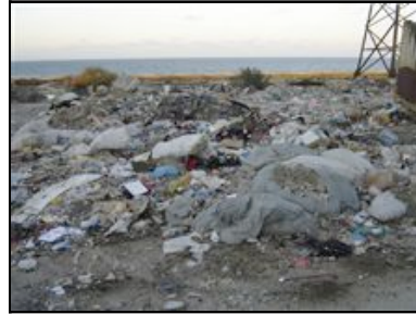
Garbage on Sumgayit's seashore (RFE/RL)

SUMGAYIT, September 18, 2007 (RFE/RL) -- On a slight incline, overgrown with grass and weeds, the graves -- some of them a simple headstone, others fenced-off and garnished with flowers -- seem to face away from the chimneys on the horizon.